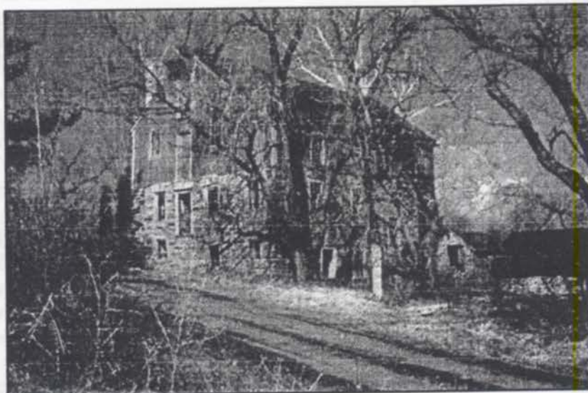
An early 20th century photo of Stover Mill on Tohickon Creek

the region. Roads such as Easton, Durham, and Old Bethlehem were primary routes for the millers' goods because they would be able to transport their products to different areas. The right configuration of water and roads allowed the Haycock area to prosper during these times.