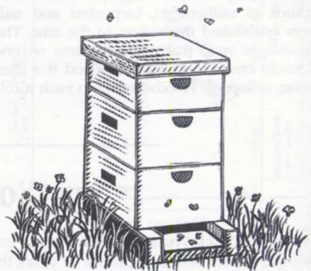
An example of a removable frame beehive

is heat resistant and can remain active for up to 60 years. Realizing the seriousness of the situation, beekeepers turned to the state government for help. The Bee Law was passed in 1921 and is still in effect today. The Bee Law requires beekeepers to notify the Pennsylvania Department of Agriculture (PDA) when they obtain new bees, and calls for apiary inspections to prevent the spread of communicable diseases between colonies. Because of cutbacks in the 1970s, the PDA realized that only about 20% of all hives in Pennsylvania were being inspected. This led to a revision of the Bee Law that requires beekeepers to register with the state every other year at the cost of $10. PDA studies have shown that regular apiary inspections lead to a decrease in AFB. PDA representatives also assist in solving other common colony problems, such as mites. Recently, bees have not been returning to the hive, leaving the queen and the brood behind to die. This has been identified as Colony Collapse Disorder, and has been affecting bees from Pennsylvania to Florida. Pollinators such as bees affect a third of the world's crop production, and the importance of their role in the food chain is being recognized once again.